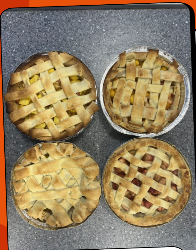
Fresh out of the oven and glazed to perfection.

They say nothing beats the smell of freshly baked bread, but we reckon we've found a close contender! As always, our GCSE Food Technology students have been busy in the kitchen this term, cooking up lots of tasty and nutritious meals. One of our favourites had to be the fruit pies - with sweet buttery pastry and a warm filling, it's the ideal treat to enjoy on a cold day! Pupils experimented with different ingredients and flavours, including mango and passion fruit, apple and mixed berries. Every single one of them was delicious! And better yet, it counts as one of our five a day...right?!