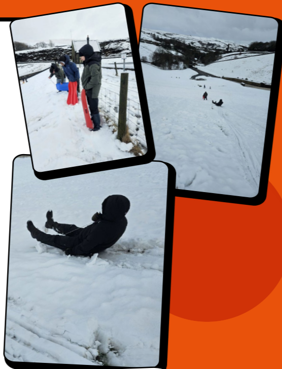
Sliding into the new year - a snowy start to 2025!

Spending time outdoors isn't just about having fun - it's crucial for our physical and mental health. It's one of the best ways to reduce stress, regulate our moods, and improve our overall fitness. We were very lucky to get some snow this winter and we hope we'll get the opportunity to enjoy it again next year. In the meantime, we look forward to all the adventures the summer months will bring!